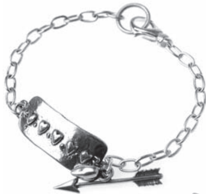
The coupling of roughly stamped silver and sweet little hearts on this I.D. bracelet (above), by the savvy Canadians at Where Did You Get That?, is indicative of Cupid's sometimes inventive coupling skills. This time, the pairing works beautifully. $150 through wheredidyoudgetthat.ca.

Architect Frank Gehry continues to dramatically reshape beloved objects with his latest blue-boxed offering for Tiffany: a clever twist on the heart. We love the chunky silver hearts stacked together on a necklace at right, but the single heart pendant (far right) deserves just as much attention. Necklace, $1,850 and pendant, $340, through www.tiffany.ca .